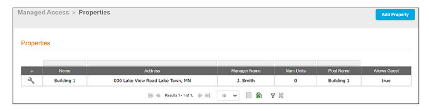
FIGURE 4 Properties Screen Before Adding Units to Newly Configured Property